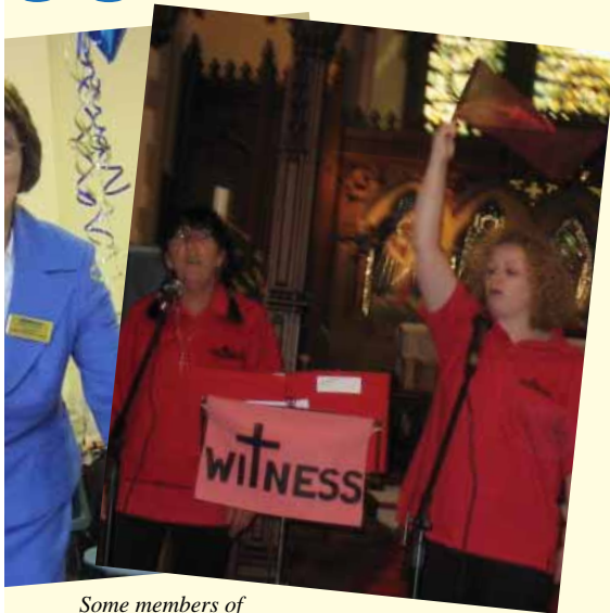
Some members of The Witness Band